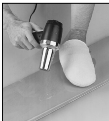
Hot Glove™ TOPR2180

Heat-resistant Thinsulate™ Hot Glove lets you touch covering while applying heat to tack, stretch and smooth. Cool Hand's five-fingered design with tiny vinyl "grabbers" gives you maximum control for manipulating heated film into place. One size fits all right and left hands.