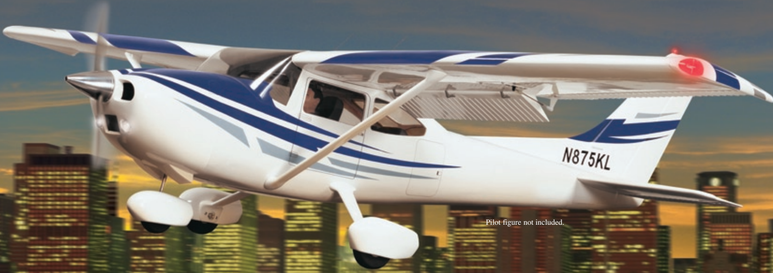
Pilot figure not included.

"ARFs engineered to enhance kit quality with assembly ease."