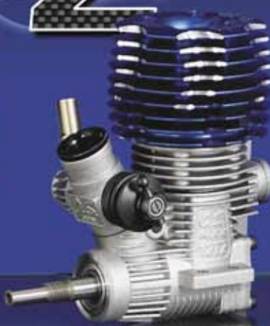
OSMG1997 12TZ (P) - T3