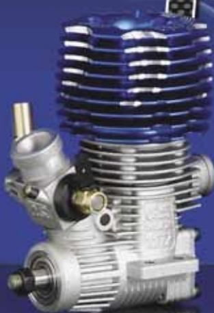
OSMG1996 12TZ (S) - T3