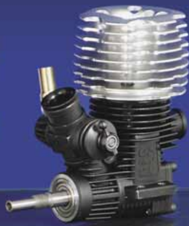
OSMG1998 12TZ (P) - T5