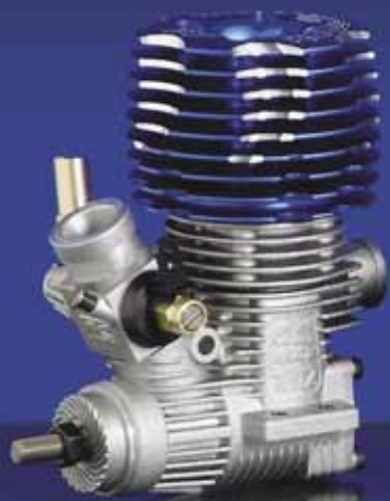
OSMG1995 12TZ - T3