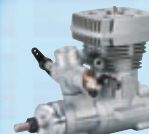
O.S.® SX-H Ringed Hyper Heli Engine (OSMG1951)