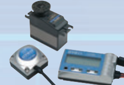
Futaba GY401 (FUTM0808) or GY611 (FUTM0825) Gyro