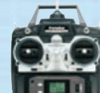
Futaba® 6EXH FM Radio (FUTK58**)