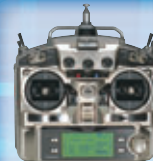
Futaba 9C Super FM Heli Radio (FUTK76**)