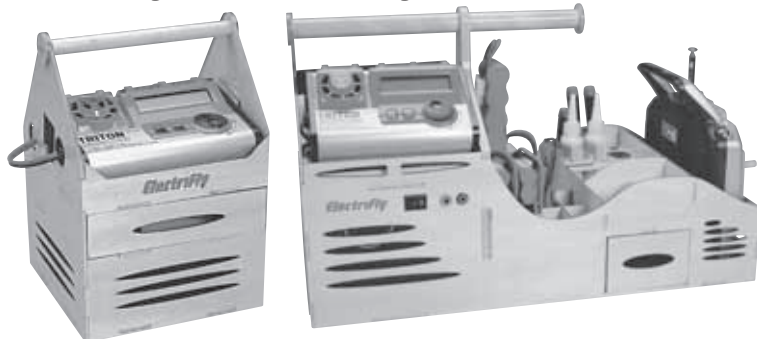
Compact E-Box (GPMP1006) Accessories not included. Ultra E-Box (GPMP1004)

They're the perfect carry-alls for electric pilots! The Ultra E-Box can hold two chargers, two batteries, a transmitter and other accessories. Storage slots on the top accept spare props, CA, tools and battery packs. Remove the divider and there's room for an expanded scale voltmeter. Once the handle is installed on the Compact E-Box, the charger can't fall out — even if the E-Box is tipped on its side. An easy-access compartment holds most 12V hobby batteries, with vents that allow heat to escape so batteries stay cool.