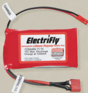
1250mAh 11.1V 3-Series LiPo Battery Pack (GPMP0823)