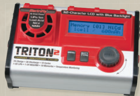
Triton2™ DC Peak Charger (GPMM3153)