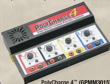
PolyCharge 4™ (GPMM3015)