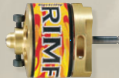
RimFire™ 28-30-950 kV Brushless Motor (GPMG4560)