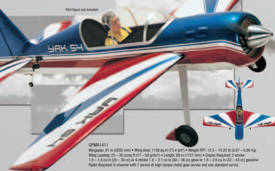
Pilot figure not included.

GPMA1411 Wingspan: 81 in (2055 mm) * Wing Area: 1138 sq in (73.4 dm 2 ) * Weight RTF: 12.5 – 15.25 lb (5.67 – 6.86 kg) Wing Loading: 25 – 30 oz/sq ft (77 – 93 g/dm 2 ) * Length: 68 in (1727 mm) * Engine Required: 2-stroke 1.6 – 1.8 cu in (25 – 30 cc) or 4-stroke 1.8 – 2.1 cu in (30 – 36 cc) glow or 1.9 – 2.6 cu in (32 – 43 cc) gasoline Radio Required: 6-channel with 7 servos (6 high-torque metal gear servos and one standard servo)