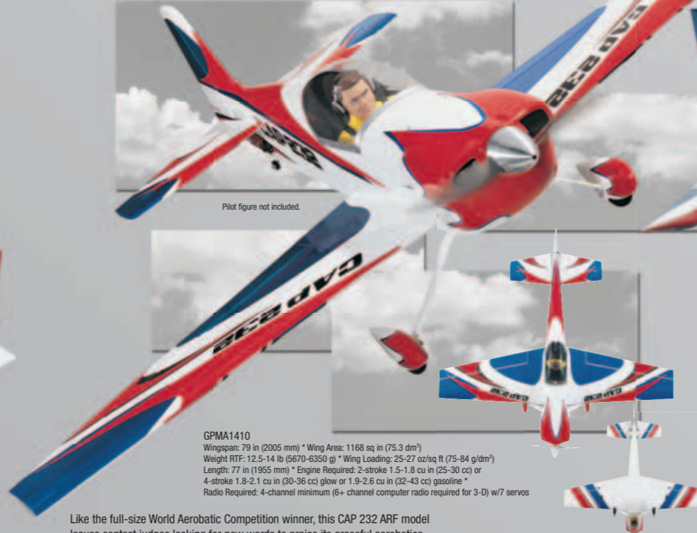
Pilot figure not included.

GPMA1410 Wingspan: 79 in (2005 mm) * Wing Area: 1168 sq in (75.3 dm 2 ) Weight RTF: 12.5-14 lb (5670-6350 g) * Wing Loading: 25-27 oz/sq ft (75-84 g/dm 2 ) Length: 77 in (1955 mm) * Engine Required: 2-stroke 1.5-1.8 cu in (25-30 cc) or 4-stroke 1.8-2.1 cu in (30-36 cc) glow or 1.9-2.6 cu in (32-43 cc) gasoline * Radio Required: 4-channel minimum (6+ channel computer radio required for 3-D) w/7 servos