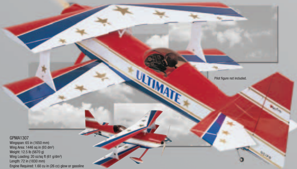
Pilot figure not included.

GPMA1307 Wingspan: 65 in (1650 mm) Wing Area: 1446 sq in (93 dm 2 ) Weight: 12.5 lb (5670 g) Wing Loading: 20 oz/sq ft (61 g/dm 2 ) Length: 72 in (1830 mm) Engine Required: 1.60 cu in (26 cc) glow or gasoline Radio Required: 4-7 channel with 8-9 servos