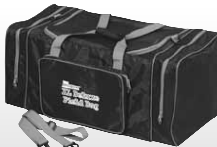
DTXP2010 Deluxe X-Large Field Bag