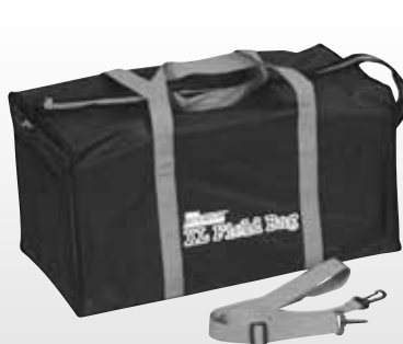
DTXP2000 X-Large Field Bag

For "grab-it-and-go" racing, these Field Bags are made to take it — constructed of heavy-duty black nylon, with a reinforced interior and multiple side pockets. Stitched handles, detachable shoulder straps and a zippered top add carrying comfort and security. X-Large measures 22.75" x 13" x 11"; Deluxe X-Large measures 27" x 14" x 12.5" and has two zippered end compartments plus a water-resistant vinyl bottom.