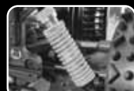
RAPID-TUNE™ ALUMINUM SHOCKS!