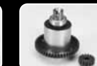
DURABLE METAL GEARS!