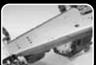
4mm ALUMINUM CHASSIS!

Everything about this off-roader is Heavy Duty!