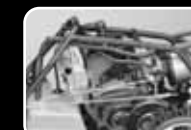
PROTECTIVE ROLL CAGE!