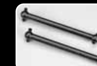
DURABLE HARDENED STEEL DOGBONES!