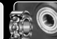
COMPLETE BALL BEARINGS!