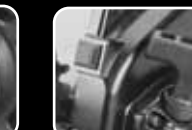
RECOIL STARTER AND KILL SWITCH!