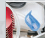
FUEL LINE CLAMP Shuts down the engine instantly, without touching the flywheel or hot exhaust.

Low-riding and race-legal. The lid seals tight with an O-ring to minimize compression losses and maintain consistent settings.