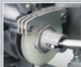
DUAL COMPOSITE BRAKE DISKS For reliable and responsive stopping power.