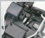
ENCLOSED RADIO BOX Protects the factory-installed receiver and receiver battery.