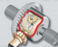
DURABLE METAL GEARS Metal differential gears, bevel gears, drive pinion and ring gear.