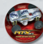
INSTRUCTIONAL DVD Shows how to operate your engine and enjoy the RT-X 27!