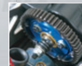
ADJUSTABLE STEEL SLIPPER CLUTCH Offers more cooling and traction control.