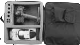
Car and radio shown not included.

Carry your Micro Street Force car — and gear — to the track with custom-fit convenience! Handsome tote features long-lasting 600D nylon construction with protective internal foam padding; secure, double-pull zippers; sturdy carrying handles and detachable shoulder straps; plus ample storage area for parts and accessories. DTXP2027