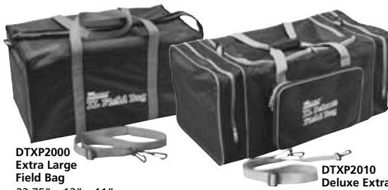
DTXP2000 Extra Large Field Bag 22.75" x 13" x 11"

It's the perfect carry-all for a day at the track! Made of heavy-duty, lightweight nylon that resists tears and punctures, with a handy shoulder strap, and roomy enough to accommodate your buggy and necessary gear. The XL Deluxe also features zippered compartments on each end, an additional front pocket, and a water-resistant vinyl panel in the bottom that offers extra protection in wet conditions and helps extend the bag's life.