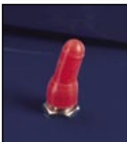
A Kill Switch is pre-installed that safely cuts engine power, and is enclosed under a waterproof cover.