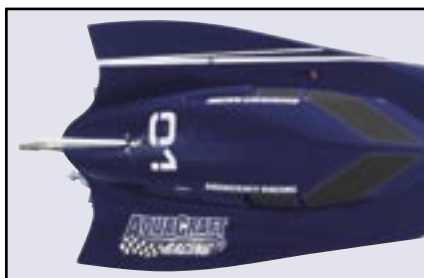
The aerodynamic hull is made of high-quality fiberglass, and is double-stepped to reduce the surface area that actually touches the water. Strakes on the underside help control water deflection. The vertical fin at the rear works with the wings on the sides to keep the boat from flipping over at high speeds.