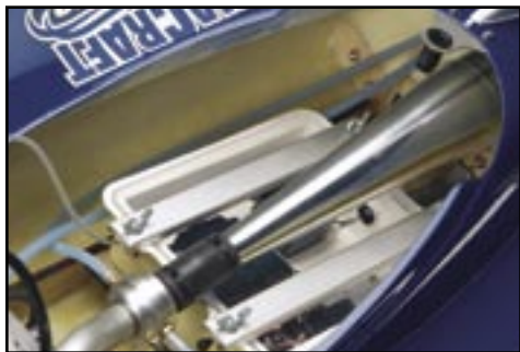
The engine's tuned pipe is made of spun aluminum, and comes with a stainless steel support bracket and exhaust header with gas coupler.