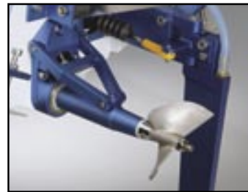
Here's even more blue-anodized, machined aluminum! The Adjustable Surface Drive system lets you alter the angle of the prop to adapt to different water conditions. By installing an optional 3rd channel, you can control this from your radio.