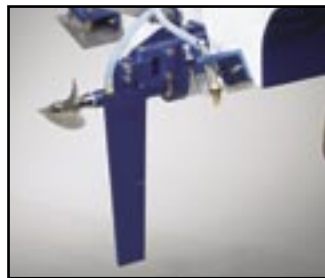
For the strength necessary to steer a boat this big, the "Super Wedge"™ rudder with water pickup is made of machined, blue-anodized aluminum — as is the control arm and support bracket that attaches the rudder to the transom.