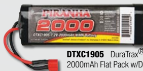
DTXC1905 DuraTrax® NIMH 7.2V 2000mAh Flat Pack w/Dean's Ultra Plug