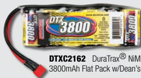
DTXC2162 DuraTrax® NIMH 7.2V 3800mAh Flat Pack w/Dean's Ultra Plug