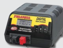
DTXP4005 Piranha™ Digital Charger