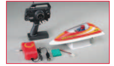
Features a hobby-quality 2-channel radio that can be converted from right- to left-hand use. Also includes a NiMH rechargeable battery and 30-minute charger.

For more information on the Reef Racer 2 or the location of the dealer nearest you, please visit the AquaCraft website at www.aquacraftmodels.com or call 1-800-682-8948 and mention code number 99P30.