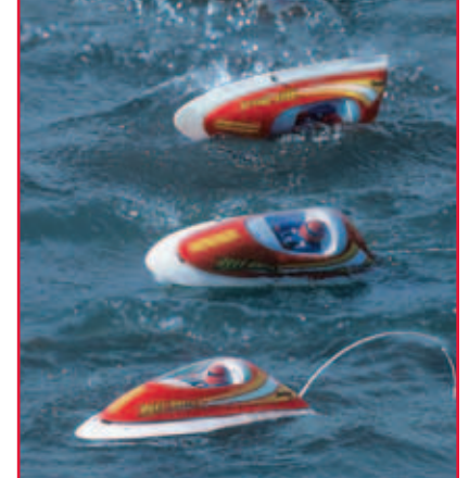
There's no stop in the action with the Reef Racer 2's unique self-righting design.