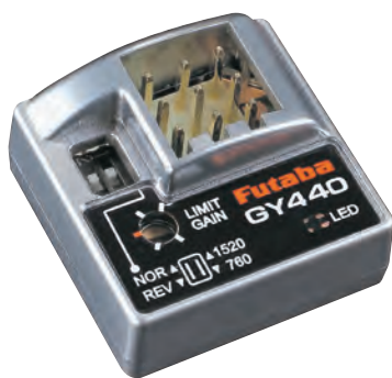
GY440 Heli Gyro