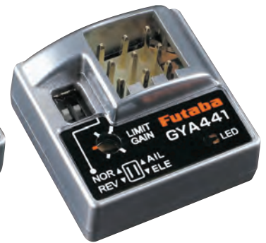
GYC440 Car Drift Gyro