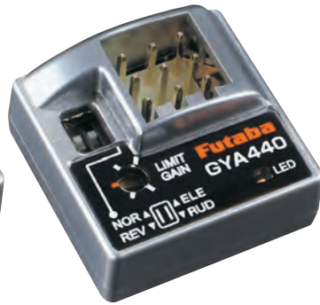
GYA440 Air Single Servo Gyro