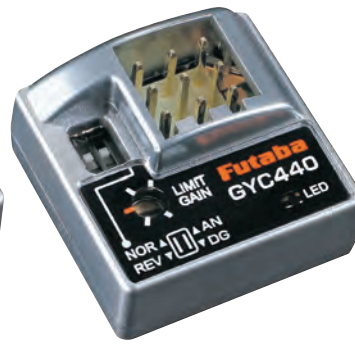
GYA441 Air Dual Servo Gyro