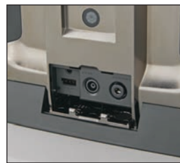
S.Bus servos can be updated and programmed using the built-in USB port.