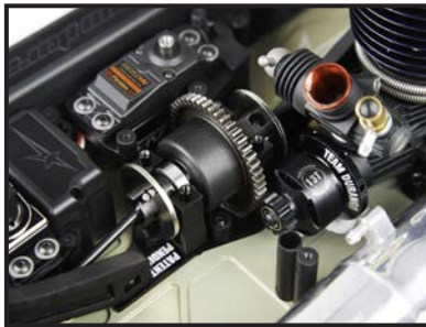
Patent-pending sliding gear mesh ensures that the motor stays in the same position, regardless of adjustments.