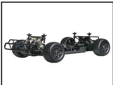
Milled shock towers reduce weight and increase durability. Etched parts deliver high quality and impressive style.