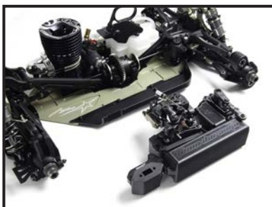
A removable radio tray makes installation of electronic components fast and easy.