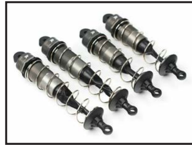
16 mm Big Bore shocks allow drivers to conquer even the most demanding tracks.