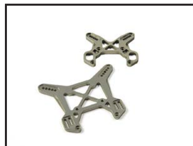
Independent active caster inserts help make the most of the dynamic, adjustable pivot ball suspension, and can be fine-tuned in just minutes.