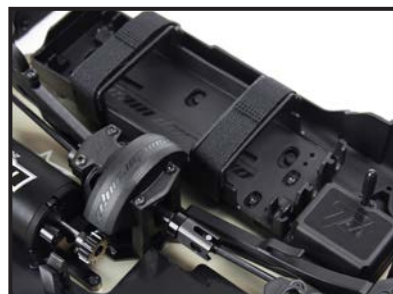
Multiple battery layout options allow racers to create custom weight configurations for faster lap times and improved agility.