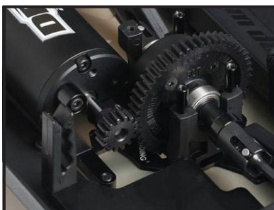
Equalized weight distribution makes handling more consistent. Fast, easy pinion changes result in efficient gear tuning.