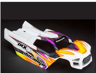
The ultra-tough, aerodynamic polycarbonate body delivers the perfect combination of durability and weight balance.