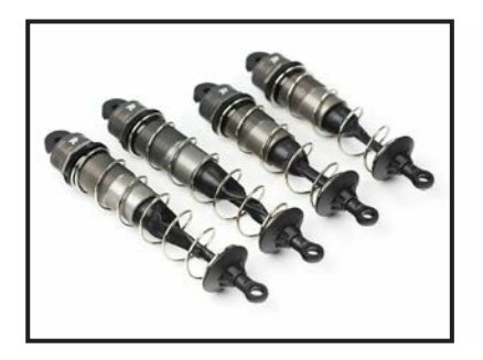
16 mm Big Bore shocks allow drivers to conquer even the most demanding tracks.