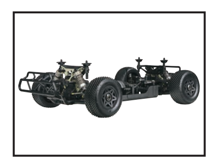
Milled shock towers reduce weight and increase durability. Etched parts deliver high quality and impressive style.