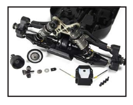
The innovative front/rear gearbox and differentials provide hassle-free servicing and faster tuning options.