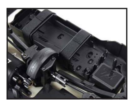
Multiple battery layout options allow racers to create custom weight configurations for faster lap times and improved agility.