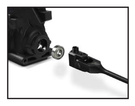
Premium aluminum inserts reduce friction wear and heat. All are factory-molded into the gearbox cases for added security.