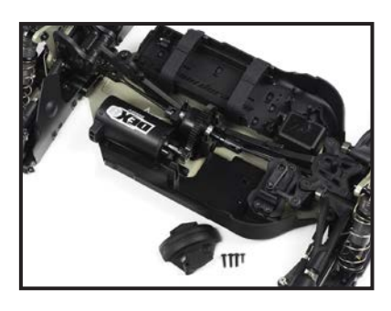
The easy-access center differential simplifies servicing.