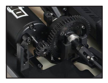
Equalized weight distribution makes handling more consistent. Fast, easy pinion changes result in efficient gear tuning.