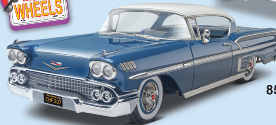
85-4419 • '58 Chevy® Impala™ • 1:25