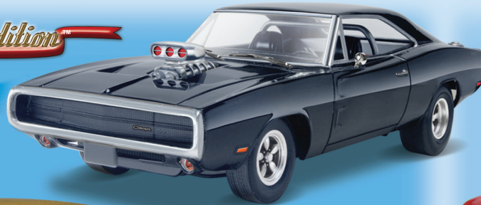
85-4319 • Fast & Furious™ '70 Dodge Charger • 1:25