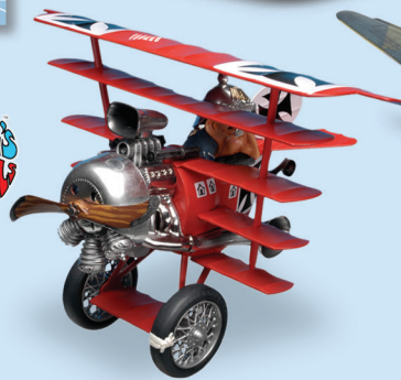
85-1735 • The Baron • NA