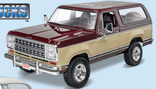
85-4372 • '80 Dodge Ramcharger • 1:24