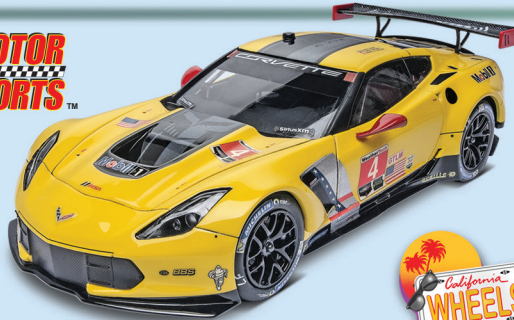
85-4304 • Corvette® C7R • 1:25