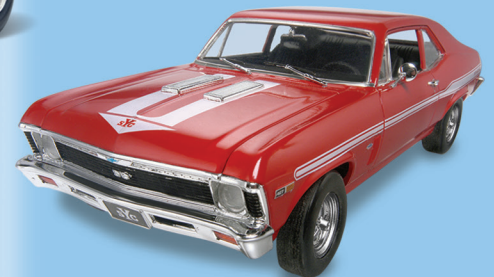
85-4423 • '69 Chevy® Nova™ Yenka™ • 1:25