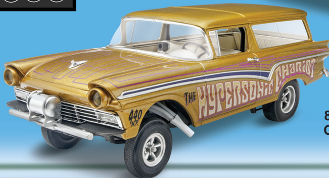
85-4396 • '57 Ford Gasser 2'n1 • 1:25