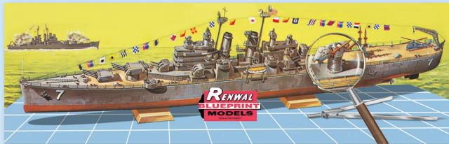
85-0602 • USS Springfield • 1:500