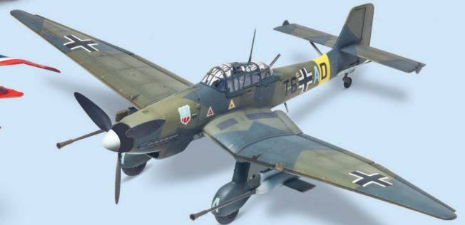
85-5270 • Stuka Dive Bomber Ju87G-1 • 1:48

AGES ANS EDADES 14+ SKILL NIVEAU NIVEL 5 HOURS HEURES HORAS 7+