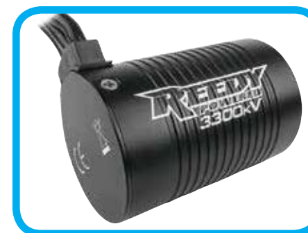
Reedy 3300Kv brushless motor.