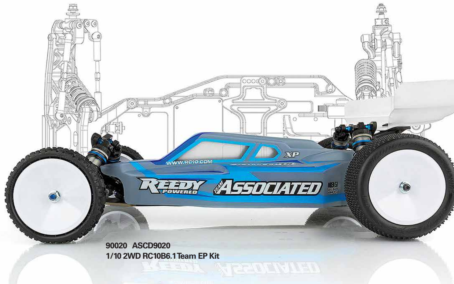
90020 ASCD9020 1/10 2WD RC10B6.1 Team EP Kit