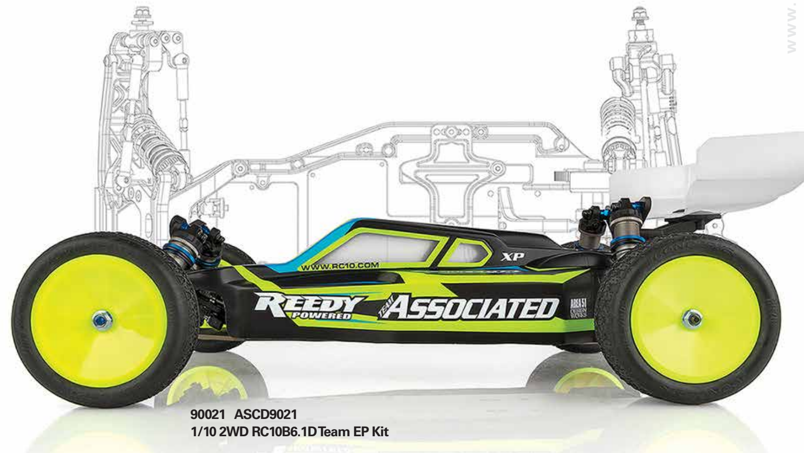
90021 ASCD9021 1/10 2WD RC10B6.1D Team EP Kit