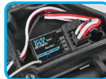
DVC (Dynamic Vehicle Control) receiver with built-in gyro.