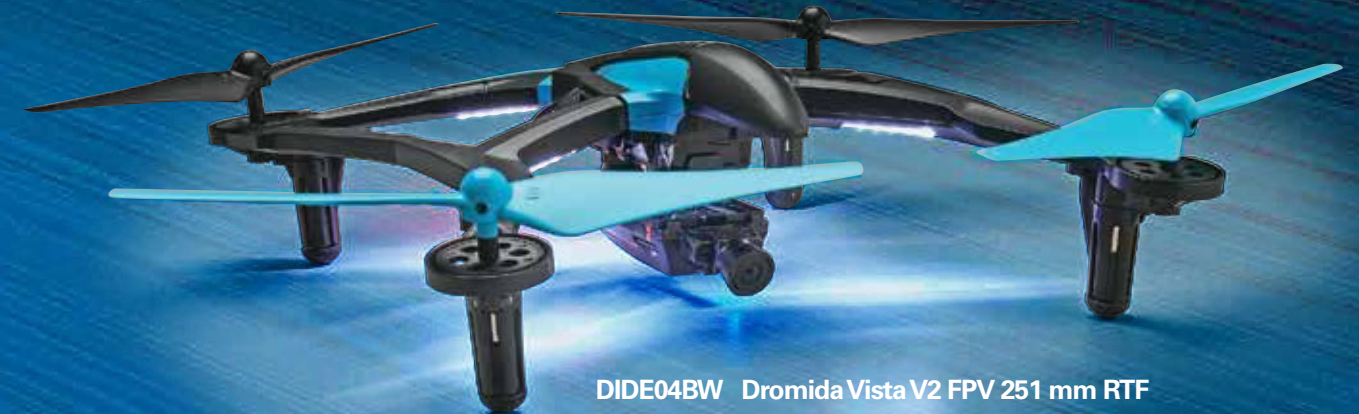
DIDE04BW Dromida Vista V2 FPV 251 mm RTF