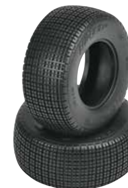
10149-01 PROC1491 Pro-Line Slide Job SC 2.2"/3.0" M2 Dirt Oval SC Mod Tires