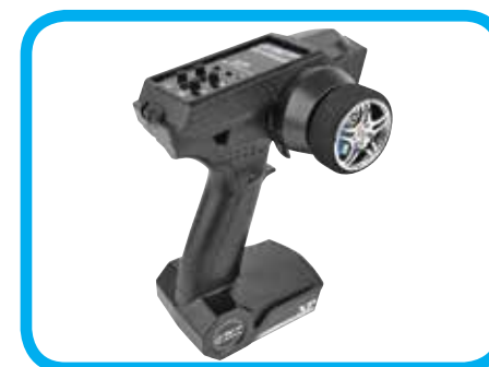
2-channel radio system.