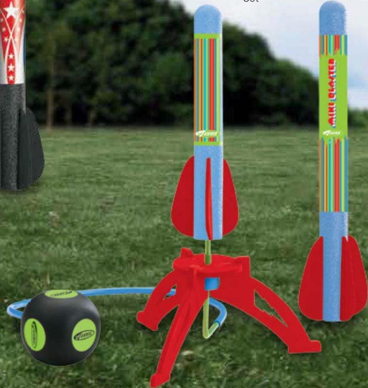
ESTH1911 Mini Blaster Launch Set