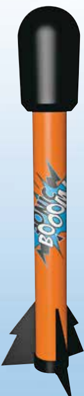
ESTH1923 Sonic Boom Launch Set