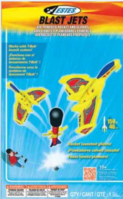
ESTH1915 Blast Jets