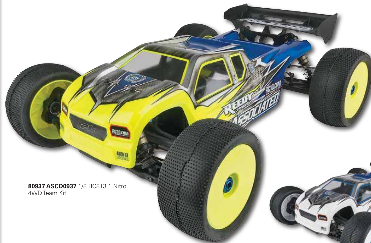
80937 ASCD0937 1/8 RC8T3.1 Nitro 4WD Team Kit