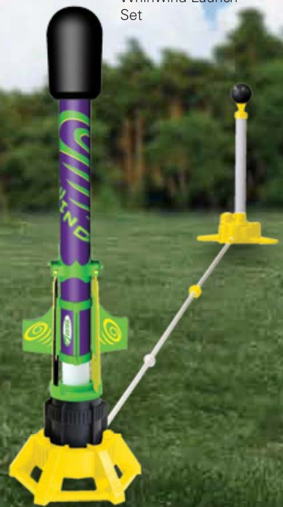
ESTH1924 Whirlwind Launch Set