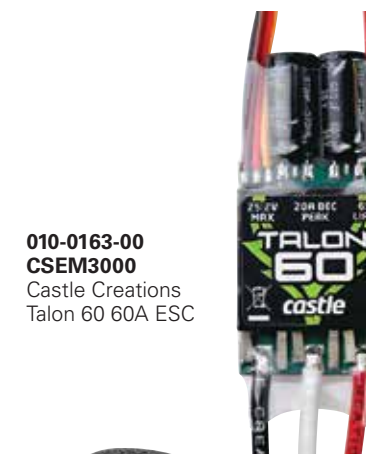
010-0163-00 CSEM3000 Castle Creations Talon 60 60A ESC