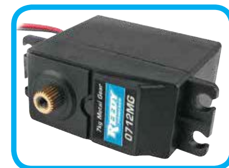
Reedy high-torque metal gear servo.