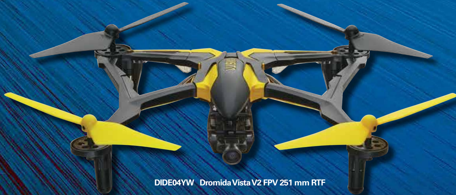
DIDE04YW Dromida Vista V2 FPV 251 mm RTF