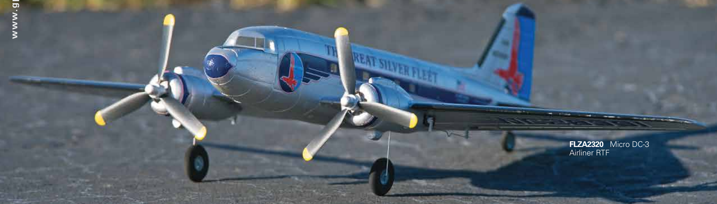
FLZA2320 Micro DC-3 Airliner RTF