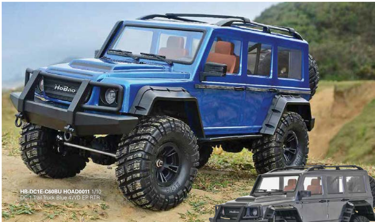
HB-DC1E-C60BU HOAD0011 1/10 DC-1 Trail Truck Blue 4WD EP RTR