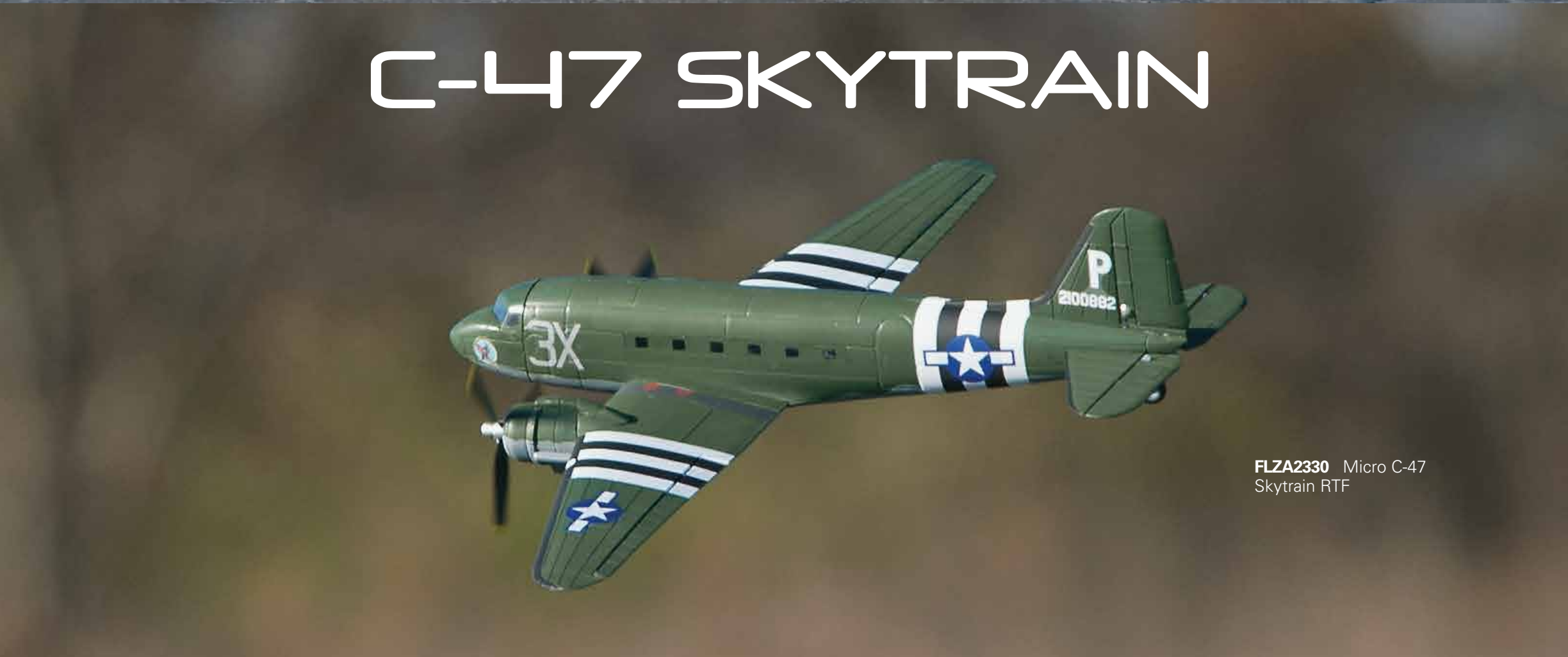
FLZA2330 Micro C-47 Skytrain RTF