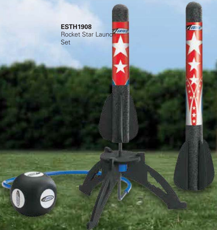
ESTH1908 Rocket Star Launch Set