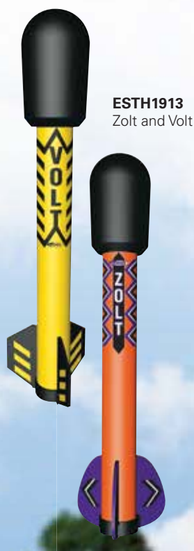
ESTH1913 Zolt and Volt

Bring learning and fun together in a big way with Estes Air rockets. These fun foam rockets are perfect for teaching kids about air pressure, wind dynamics, and gravity. It's not all learning, though, it's also fun! The thrill and wonder of watching these soar into the sky will bring delight to kids and kids at heart.