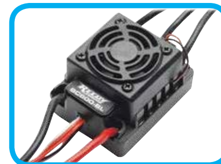
Reedy water-resistant brushless ESC.