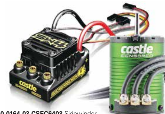
010-0164-03 CSEC6403 Sidewinder 4 ESC/1406 1Y 6900Kv Motor