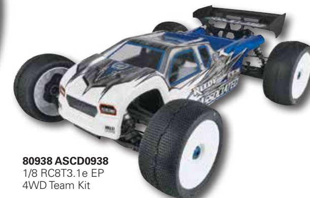
80938 ASCD0938 1/8 RC8T3.1e EP 4WD Team Kit